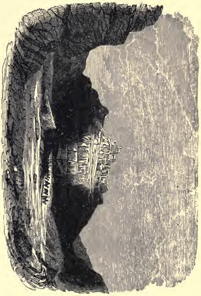
TOMB OF HIRAM ABIF.