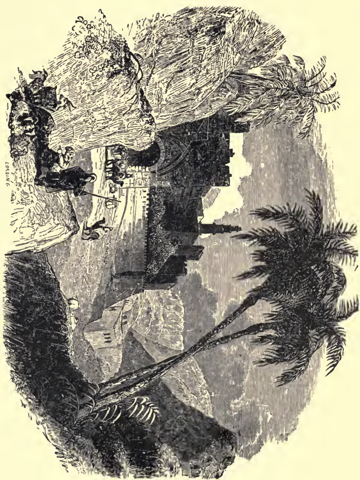
HILLS AND WALLS OF JERUSALEM.