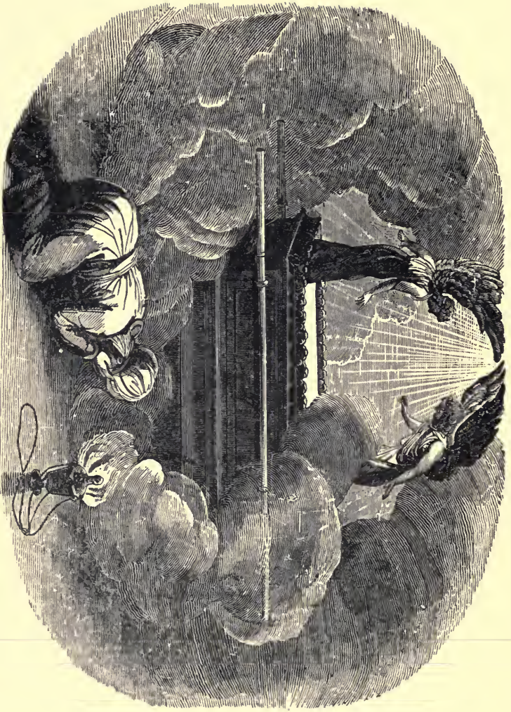
FORM OF THE ARK OF THE COVENANT.