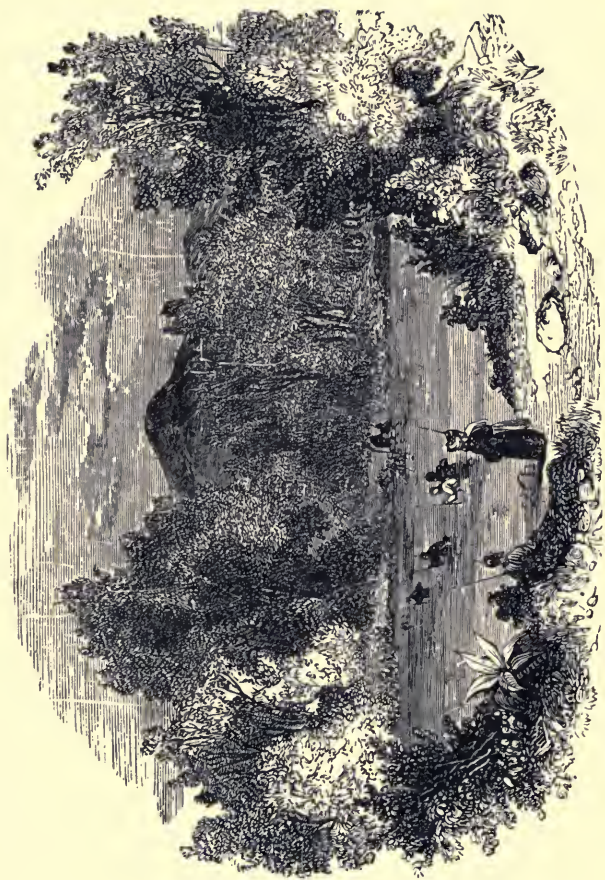
DR. TALMAGE BAPTIZING IN THE RIVER JORDAN.