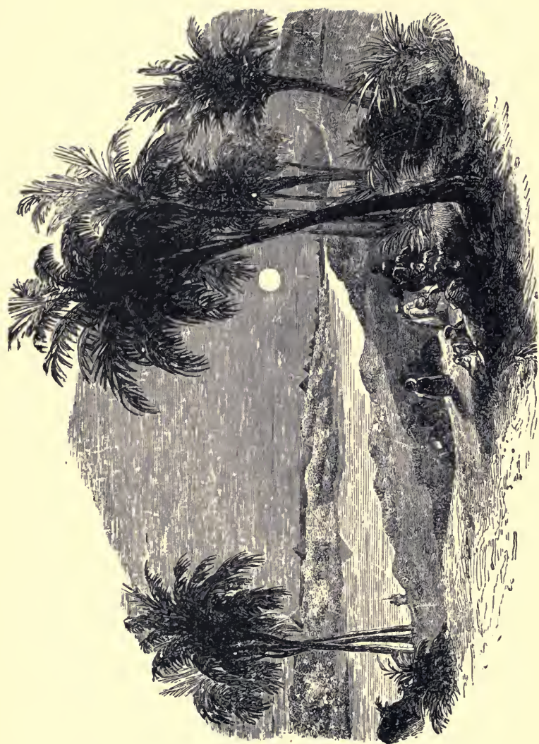
VIEW OF THE RIVER NILE.